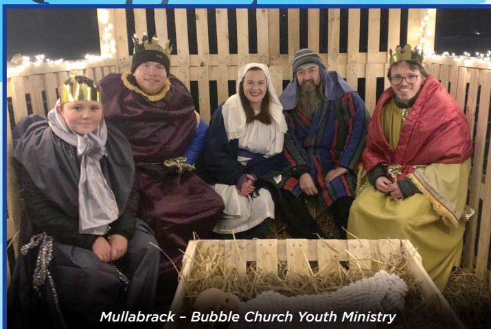
Mullabrack – Bubble Church Youth Ministry