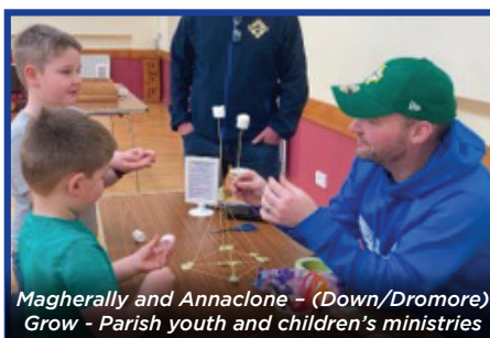
Magherally and Annaclone - (Down/Dromore) Grow - Parish youth and children's ministries