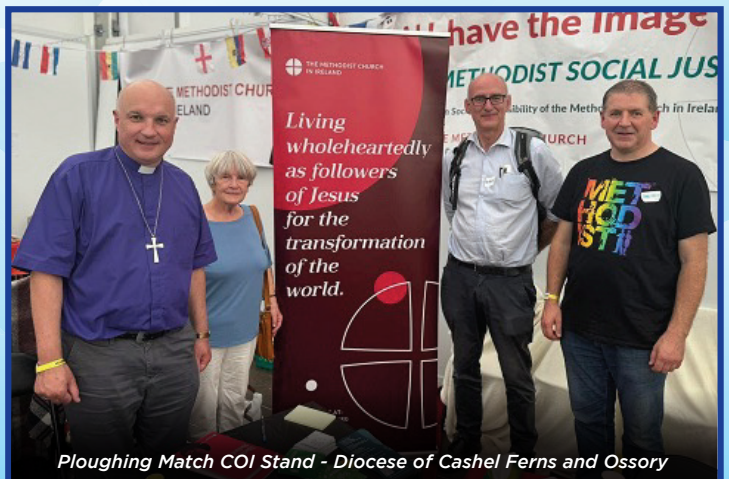
Ploughing Match COI Stand - Diocese of Cashel Ferns and Ossory