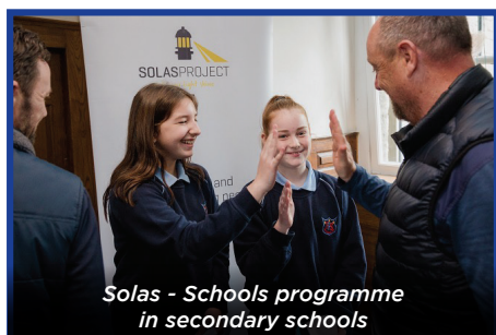
Solas - Schools programme in secondary schools