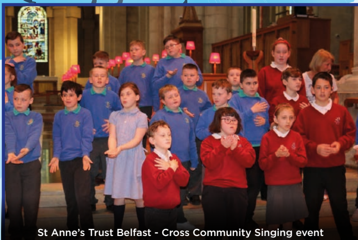
St Anne's Trust Belfast - Cross Community Singing event